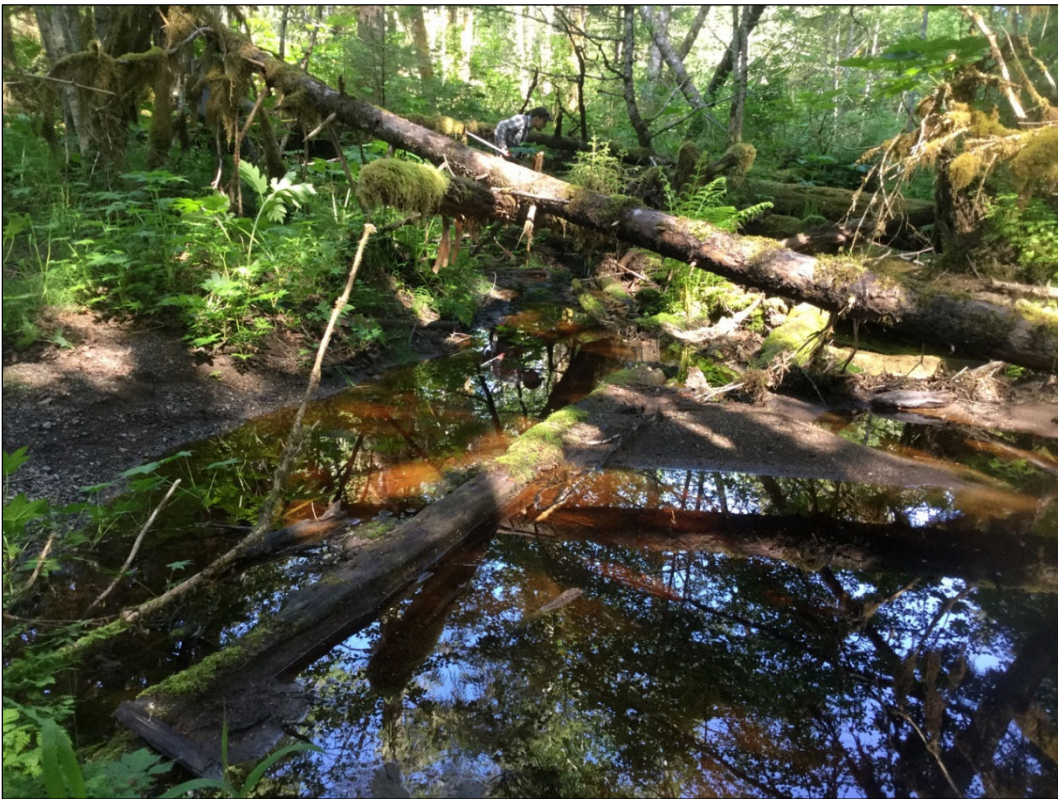
Figure 2.—Channel at waypoint 761.