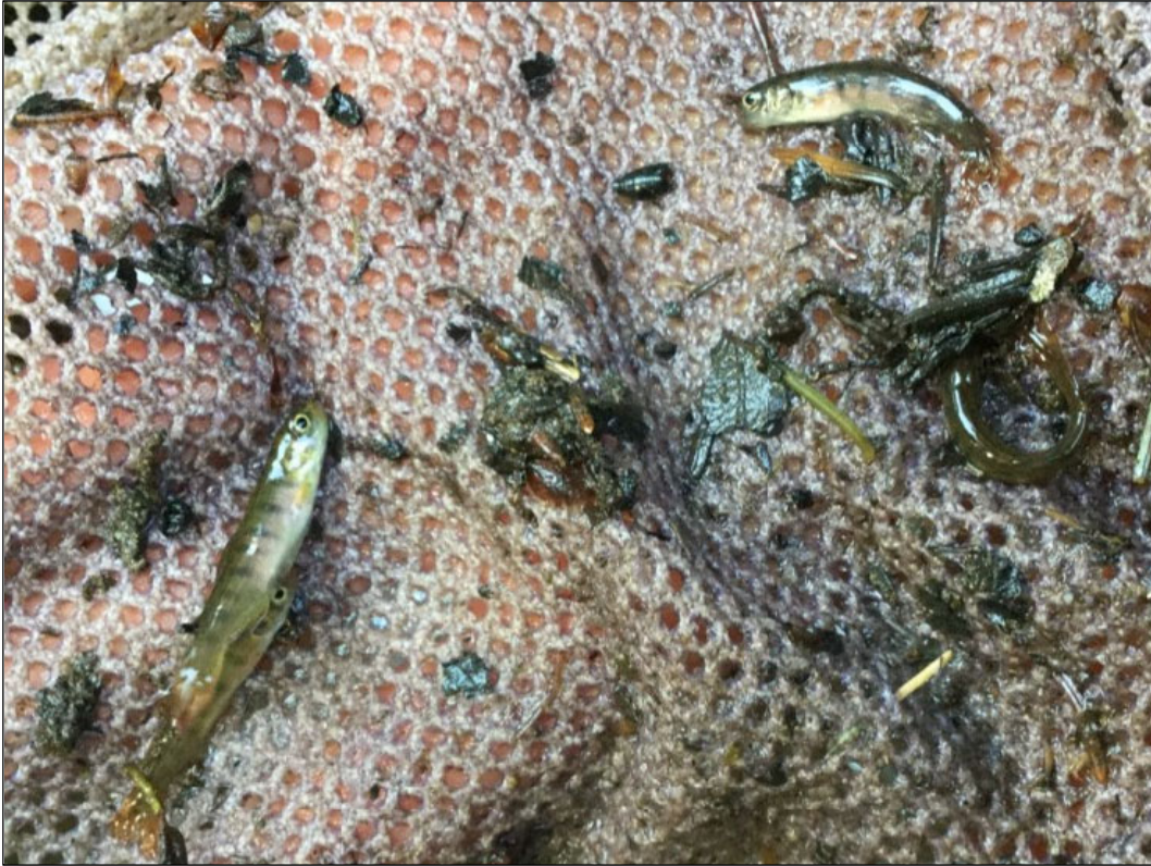
Figure 1.—Juvenile coho salmon captured at waypoint 762.